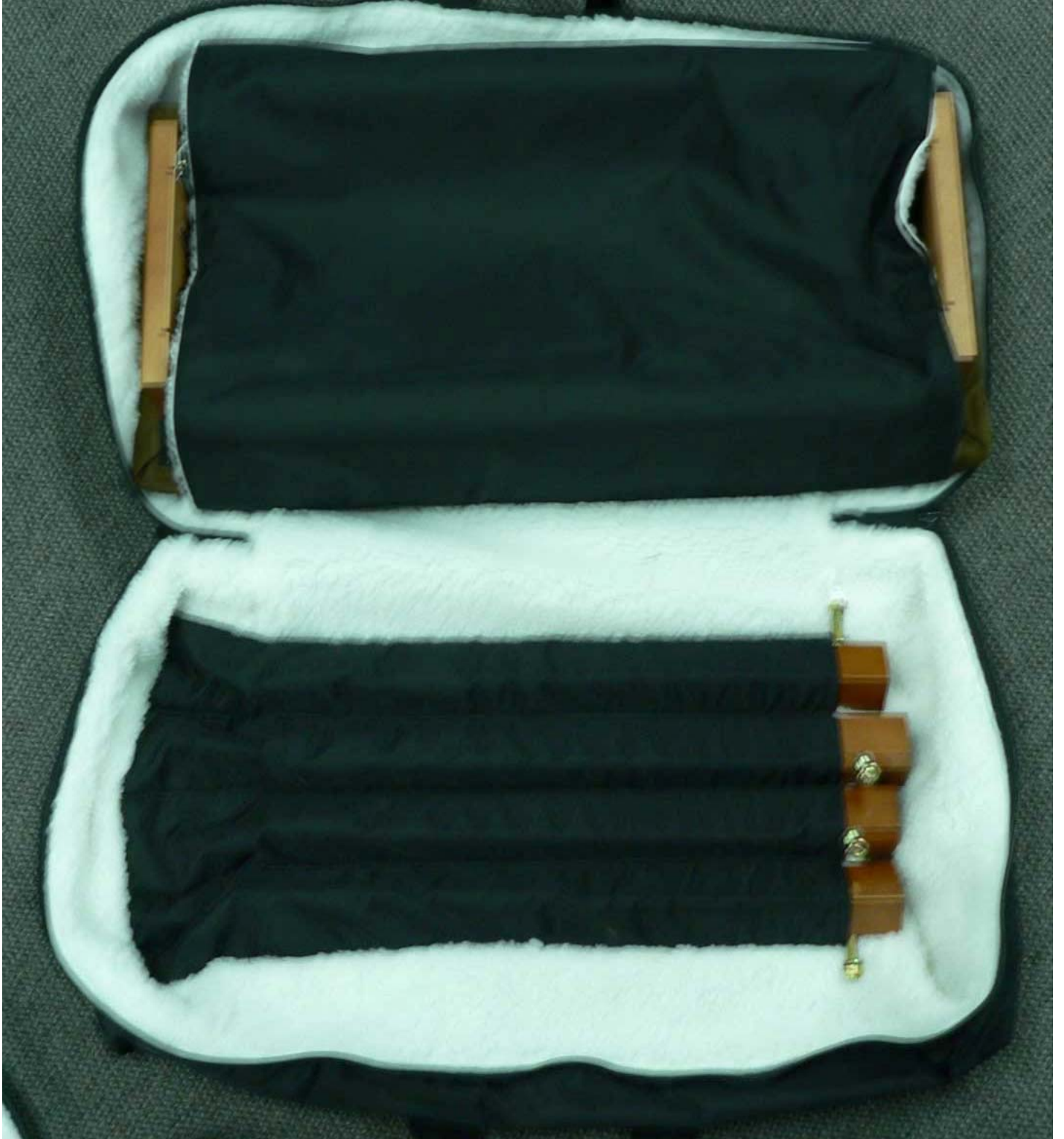
Bench case, closed, with bench