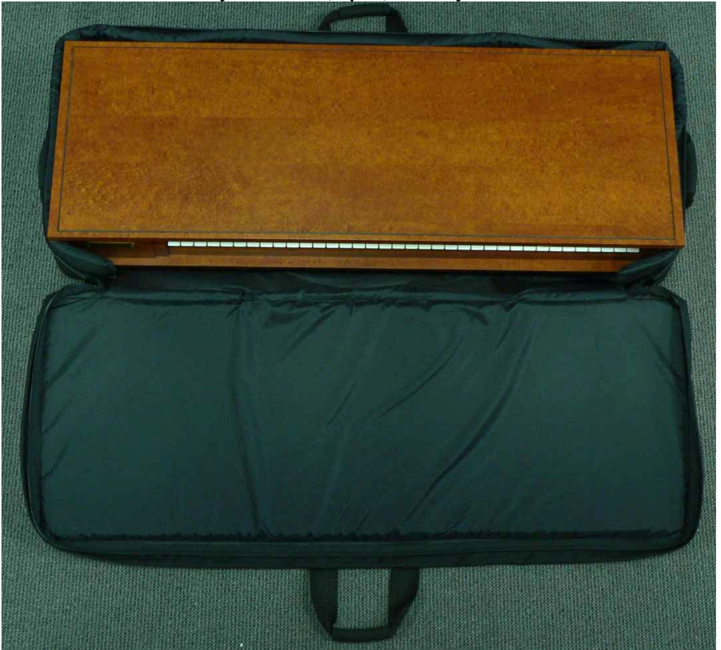
Keyboard case, bottom, closed, with keyboard