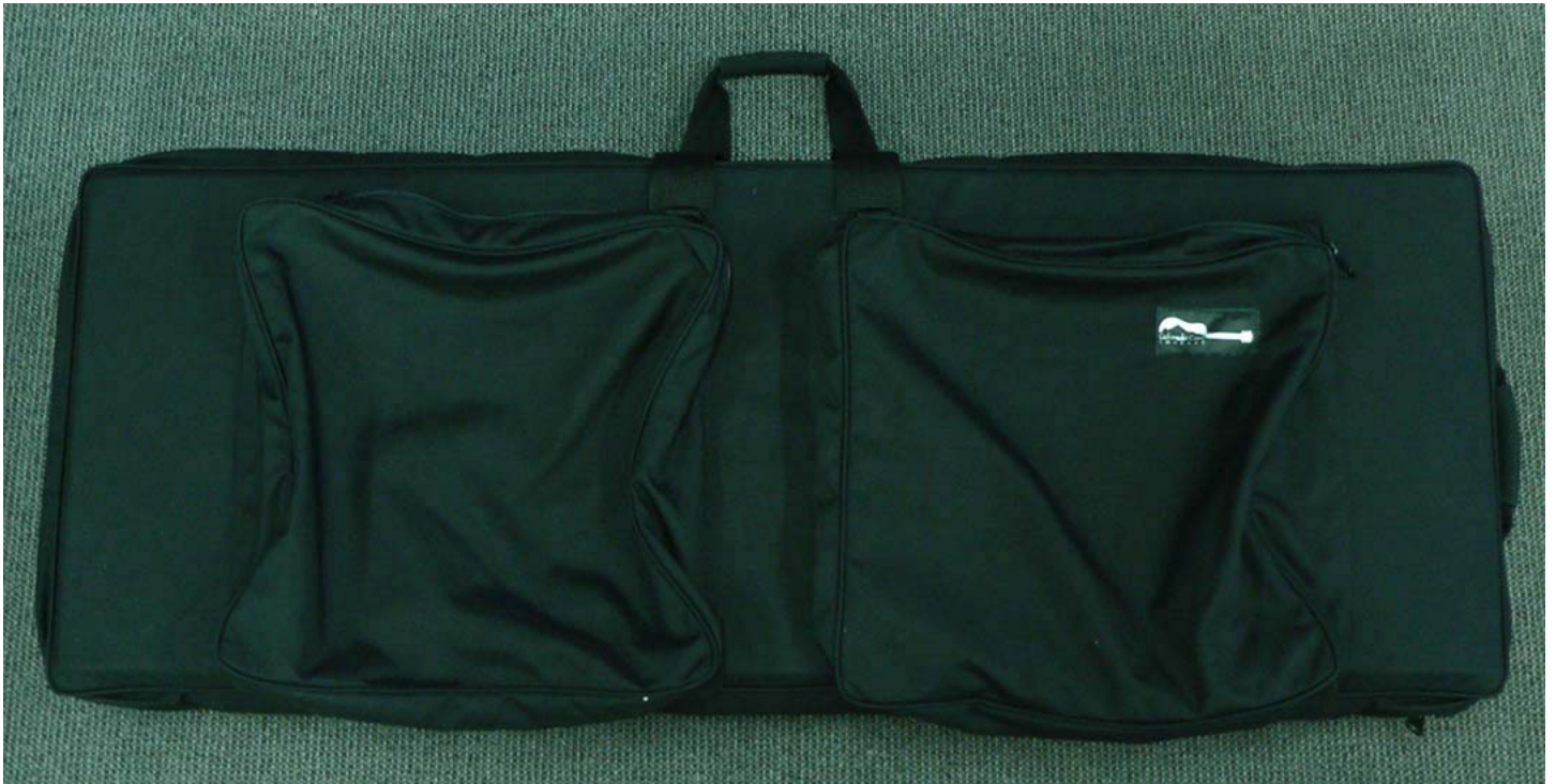
Keyboard case, side, with keyboard