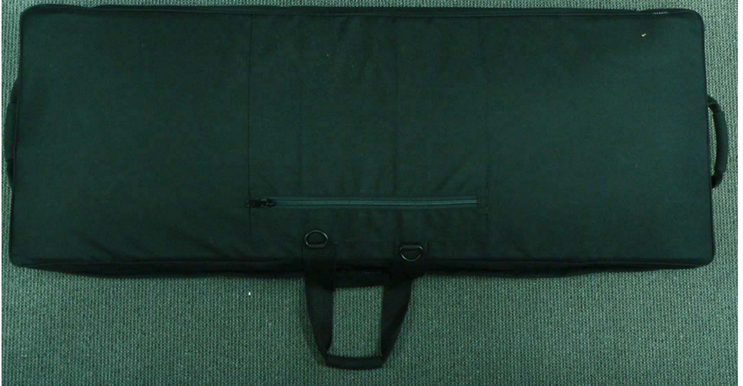
Keyboard case, closed, top, with keyboard, showing accessory pockets